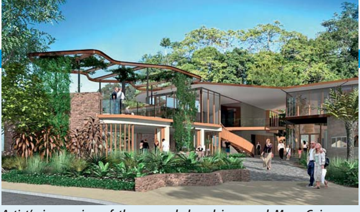
Artist's impression of the expanded and improved Mary Cairncross Reserve building.