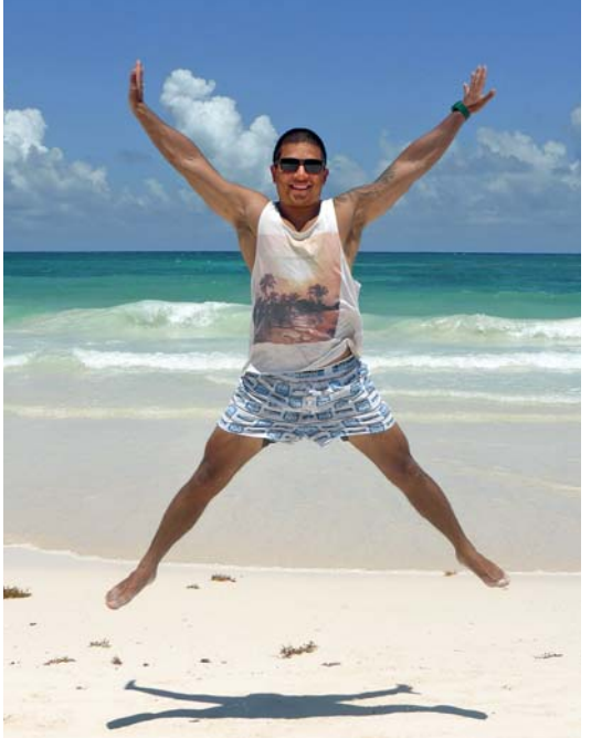
Isaac Soper is a star in Mexico.