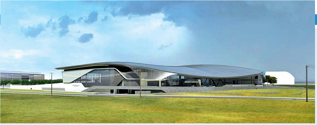
Hutchies is undertaking the design and construction of a world-class private jet base at Melbourne's Tullamarine airport.

just 12 weeks to complete. Work involved full height racking, a temperature controlled room as well as a 700m² concrete hard stand driveway to suit road train access and forklift unloading.