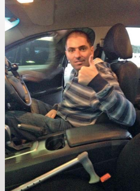
Millsy back behind the wheel.

the simple things we take for granted are our most valuable possessions.