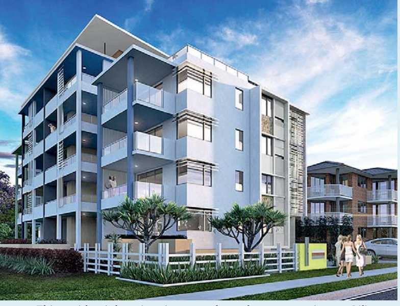
This residential project is currently under construction at Bilinga opposite the Gold Coast Airport.

Client: . . . . . . . . . Hobart City Council