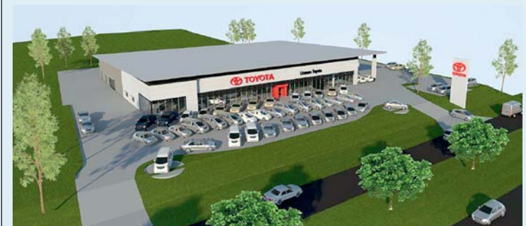
Artist's impression of the new Toyota showroom and service centre under construction in Lismore.

Normal Stranding Stranding Stranding Stranding Stranding Stranding Stranding Stranding Stranding Stranding Stranding Stranding Stranding Stranding Stranding Stranding Struct Engineering Consultant: Glynntucker Client: Jape Kong Su Nominees