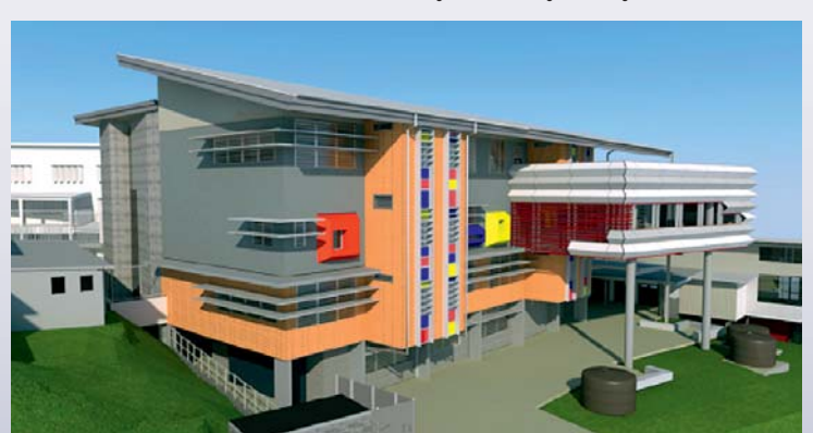
Proposed new 'C Block' under construction by Hutchies.

It is scheduled for completion by February next year.