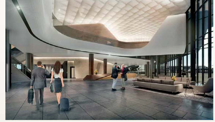
Tullamarine's non-curfew status will give the new Melbourne Aviation Precinct Corporate Jet Base an around-the-clock operating capacity.

prepared for onward journeys, the terminal will provide a stateof-the-art environment, with integrated lounge and business facilities for its passengers.