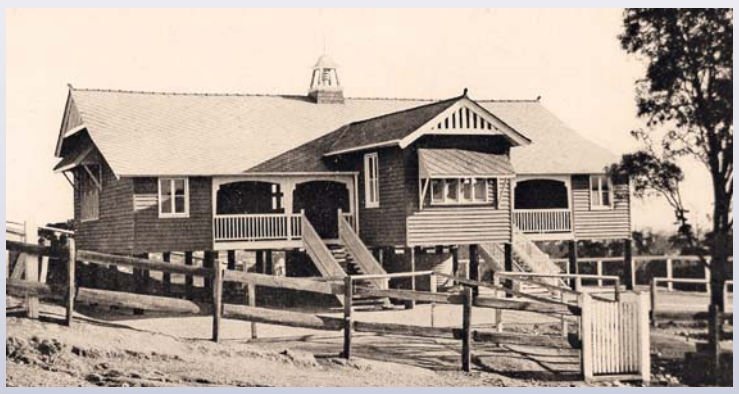
The old Hutchies-built 'C Block'.