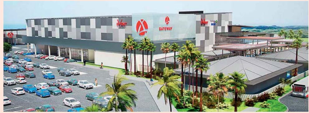
Gateway Palmerston's 37,000m<sup>2</sup> of roof area will contain 1.5 megawatts of solar panels.

Stage one of the 15-hectare site, south of Darwin, consists of 40,000 square metres of retail space to accommodate Woolworths, Big W, a six-screen Event Cinemas complex, 100 specialty stores and kiosks, dedicated restaurant precinct and a food court with seating for more than 350 patrons.