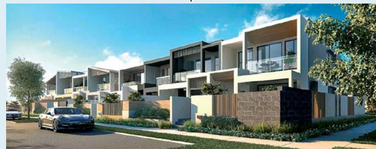
On completion, Botanique will boast 75 terrace homes.

Job Description : A new 600m<sup>2</sup> warehouse with attached office and chemical store took