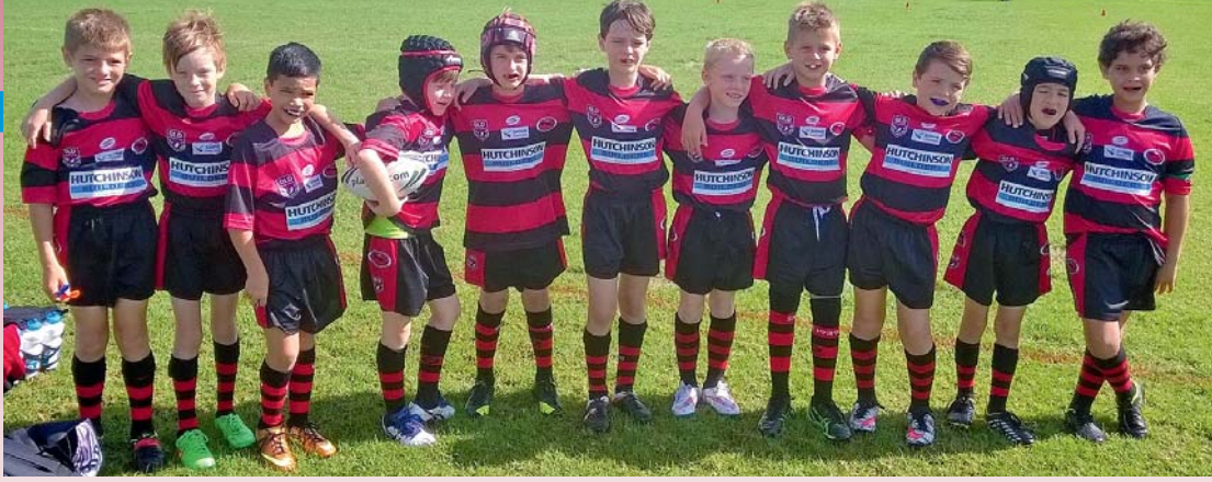
Hutchies has a strong visual presence at Purtell Park as the major Panthers sponsor for 2016.

The Panthers' home base at Bardon's Purtell Park was