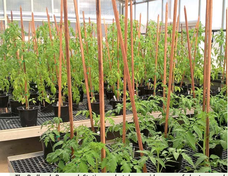
The Redlands Research Station undertakes a wide range of plant research ... and these pot plants have been positively identified as tomatoes!

A GLASSHOUSE, refurbished by Hutchies at the Redlands Research Station near Brisbane, will contribute to the health and well-being of people in Asia and Africa.