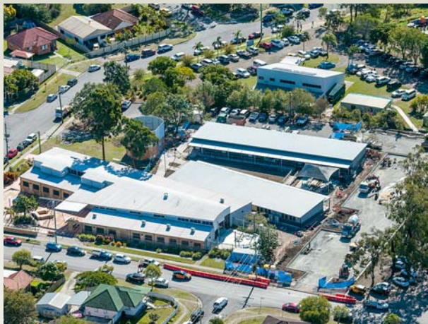
Two new buildings were added in record time to the existing TAFE complex at Inala.

THE Department of Education and Training gave Hutchies a tall order when it requested classroom and amenities buildings, as well as a 63-space carpark, to accommodate 180 students at Inala TAFE – all to be delivered in 13 weeks.