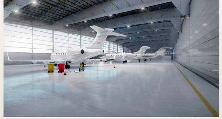
The jet base will have hangar capacity for up to 18 aircraft.